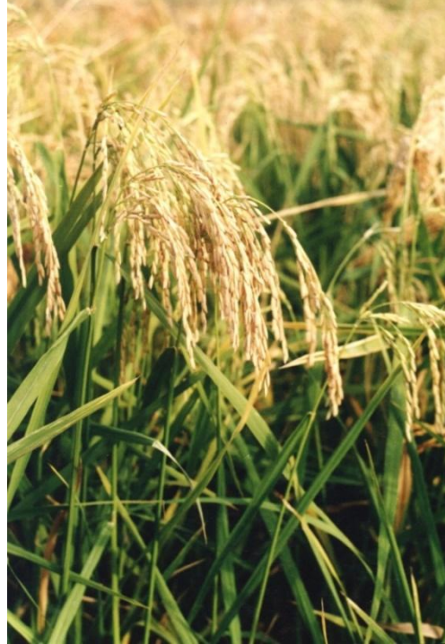
Rice variety Snezhinka