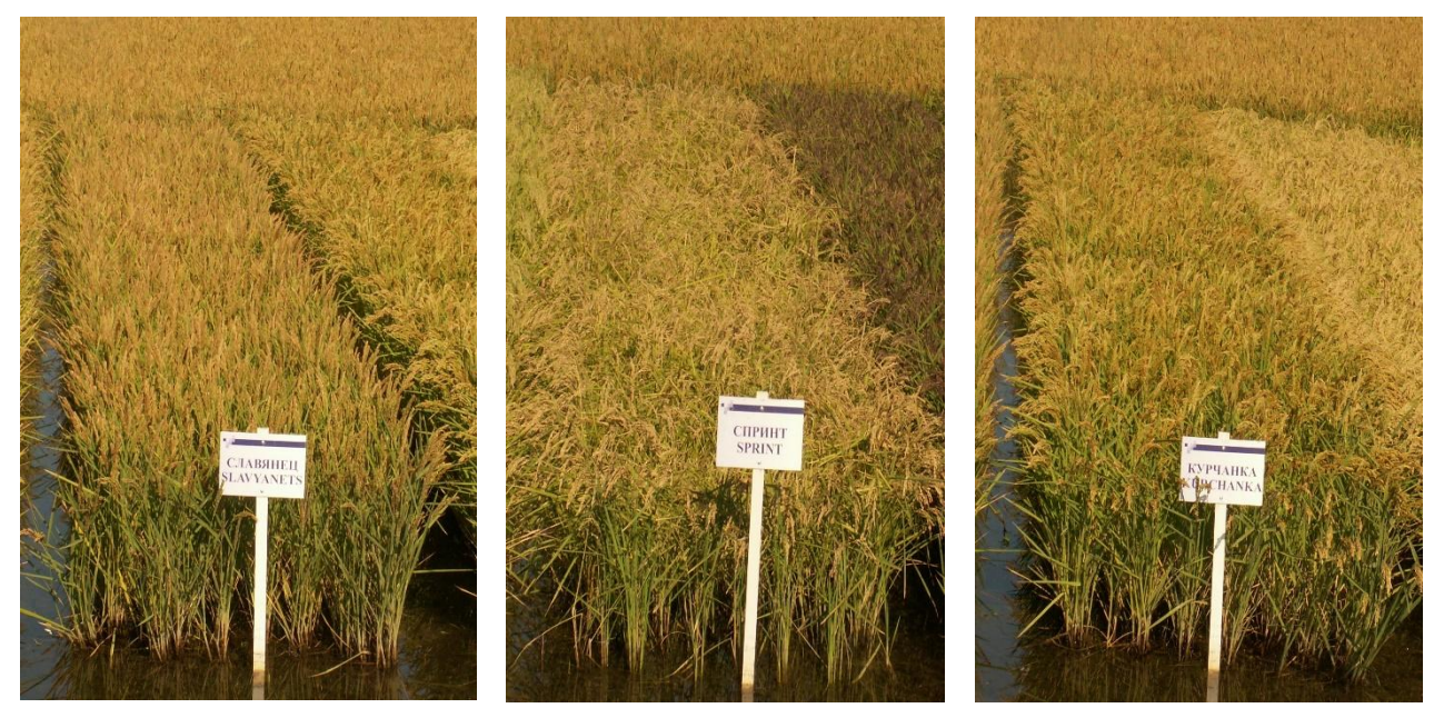
Demo fields with varieties Slavyanetz, Sprint and Kurchanka

In addition to this variety it became possible to select in the infectious nursery a number of samples with minor injuries during blast epiphytotic development. These were used as parental forms for hybridization as having high field resistance. Among them are local samples VNIIR 87, VNIIR 1619-90, Mutant 533, VNIIR 7630, Kr-3-84, and the Japanese varieties Shimokita and Reimei .