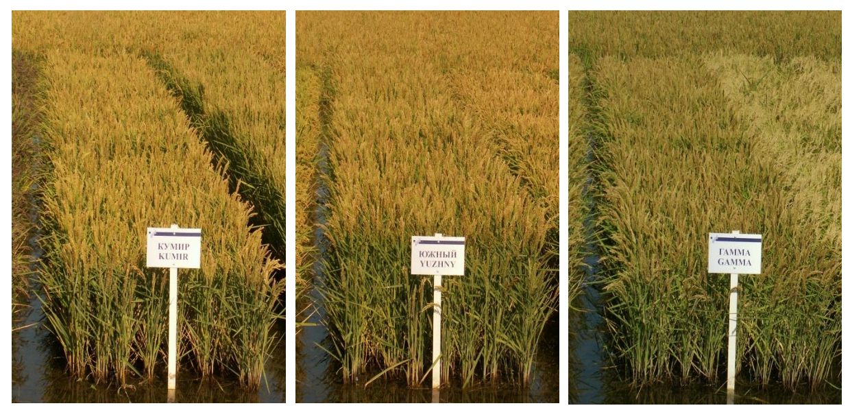
High yielding rice varieties resistant to blast Kumir, Yuzhny and Gamma

No shattering even in case of overmatured stand, but the panicles are easily trashed out. Therefore harvesting can be either direct or two-stage.